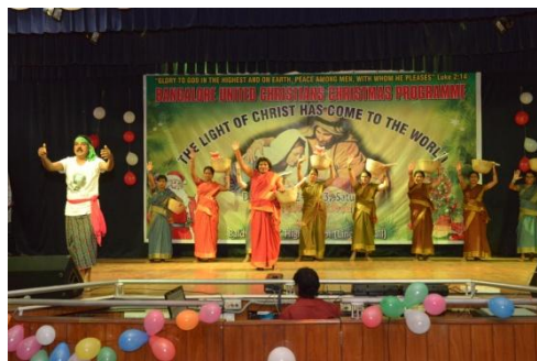
The Methodist Baldwin Boys' School staff performing an excellent piece of fisher women dance at the BUCF's Christmas event