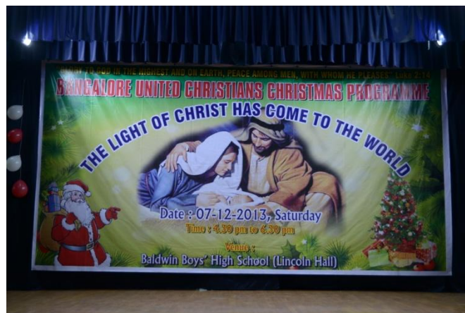
The Bangalore United Christian Forum organized Christmas program at Baldwin Boys' School 7.12.2013