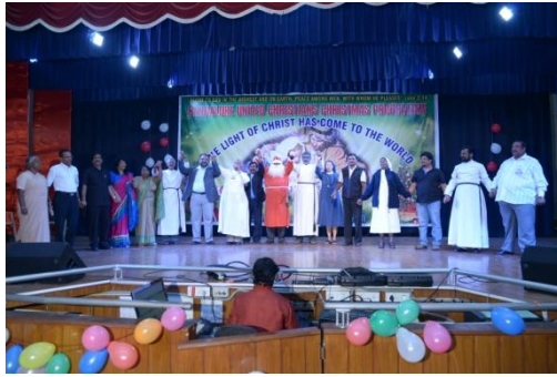
BUCF stands united singing unity anthem